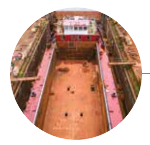
One of the biggest drydocks in Goa's private sector at 84 metres long, 16 metres wide and a draft of 2.5 metres, it has all the necessary infrastructure and facilities to accommodate and repair vessels up to 4000 DWT.

With 100 acres newly added to house its new cutting-edge dry docks & ship-building facility at Dabol in Maharashtra, Mandovi Drydocks is poised for a great leap ahead with clients across India and Middle East.